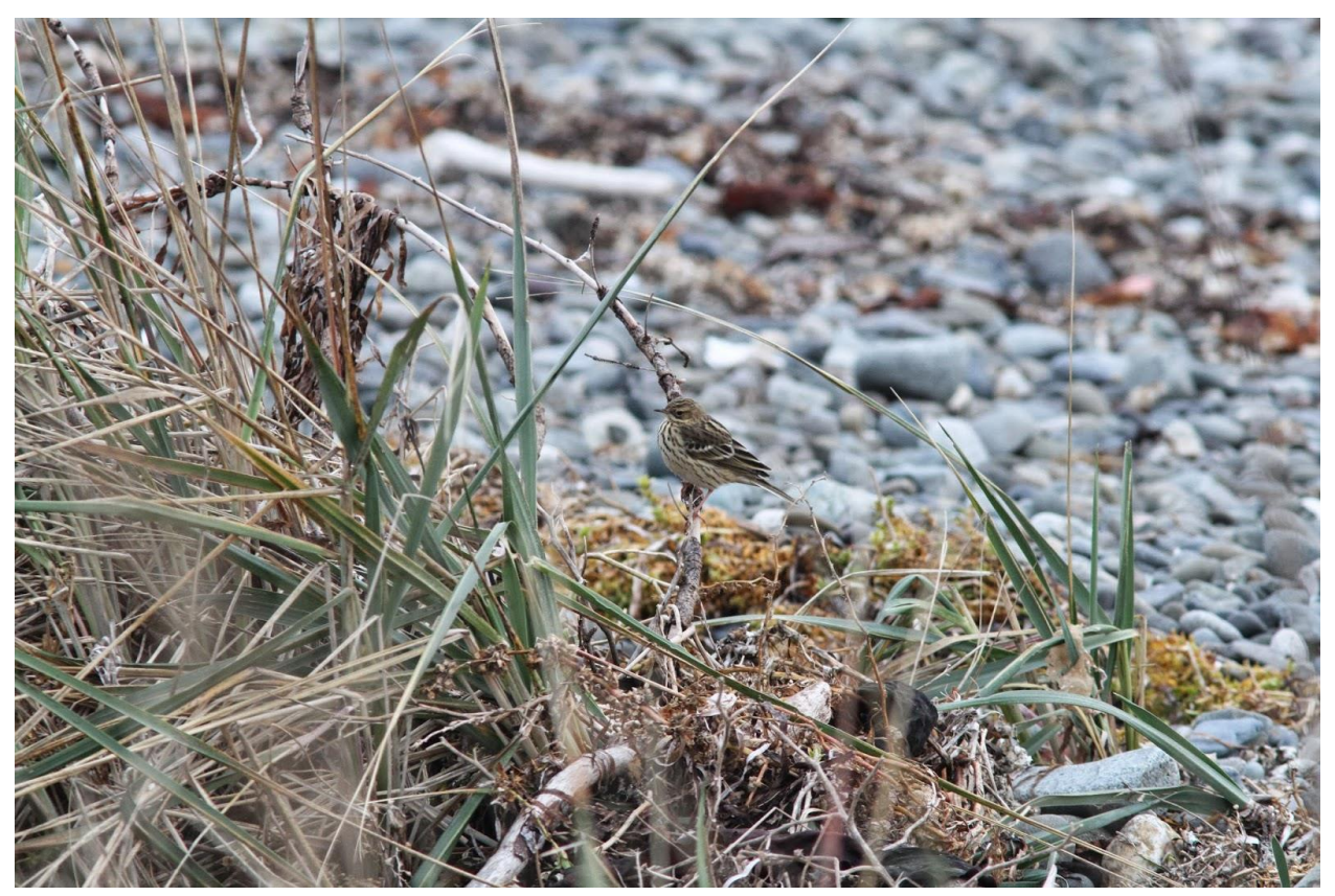
Figure 1: Record #31: Red-throated Pipit immature at Sandspit, Queen Charlotte Islands on October 12, 2013.

The Red-throated Pipit is more likely to be heard before it is actually seen (Alstrom and Mild 2003). Observers wanting to find this species should become familiar with the Red-throated Pipits' distinct call note. On the ground, the Red-throated Pipit has a preference for denser vegetation than American Pipit, but this species has been detected in open grassy areas, turf farms, beaches, and other areas where American Pipits congregate (Alstrom and Mild 2003). As with any sighting of a rare species, photographs or audio-recordings of the call notes are encouraged to properly document all provincial records.